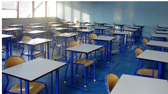
The Best for Each Student

OFHSA takes direction from its membership. Our policies allow us to speak with a collective voice provincially for Home & School members about education, health and safety, and social issues as we strive to obtain "The Best for Each Student".